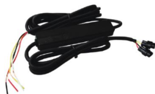
Led Flash Controller